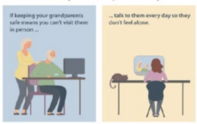
Physical distancing is not social isolation